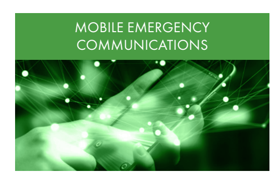
Draft and send new messages, view sent messages, and track delivery and response status from anywhere.