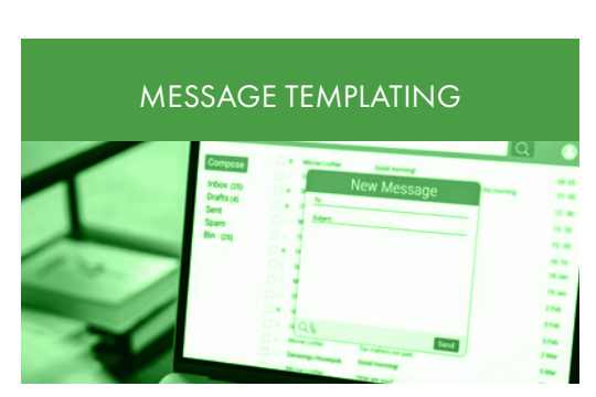
Save valuable time with communication holding statements and templated messaging.