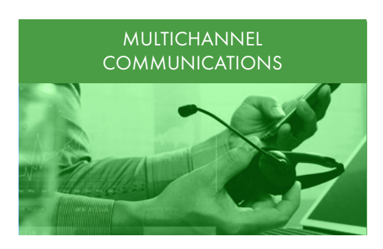
Deliver communications via voice, email, and SMS.